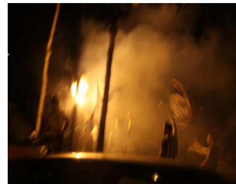
From Pan-demonium : Gul Rose Smil, Mass Hysteria, Istanbul , 2009